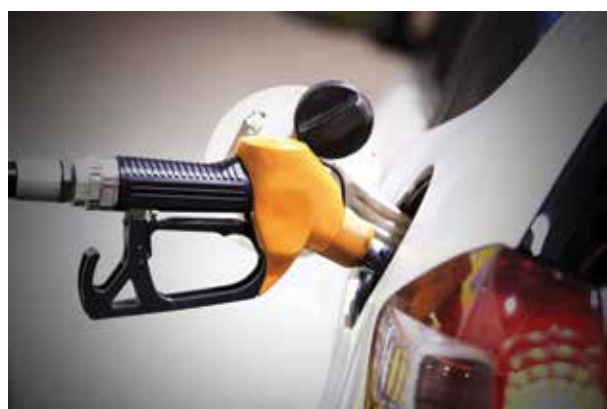
EPA has again proposed conventional ethanol levels below statute